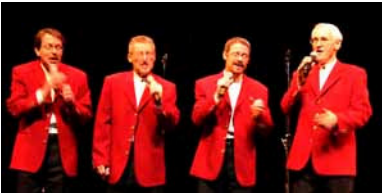
Photographs at the Arden theatre